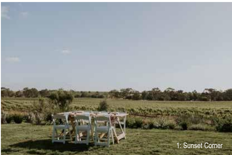
1: Sunset Corner