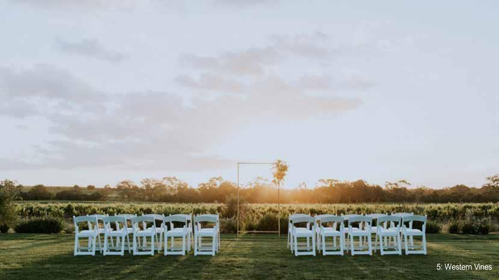
5: Western Vines

At Lanzerac Country Estate, we're passionate about providing unique and memorable wedding experiences.