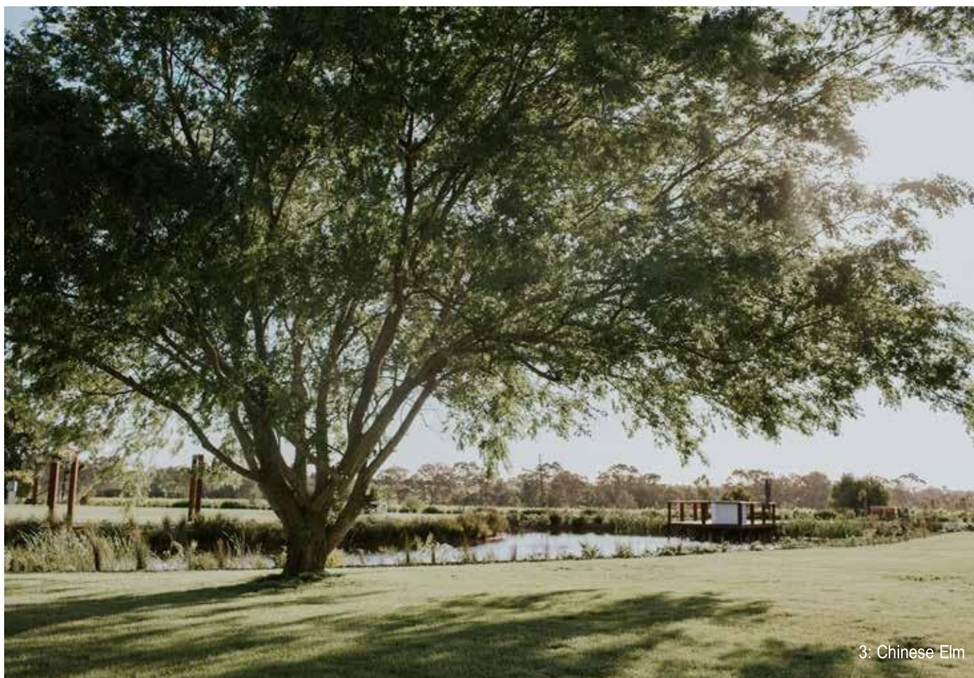
3: Chinese Elm