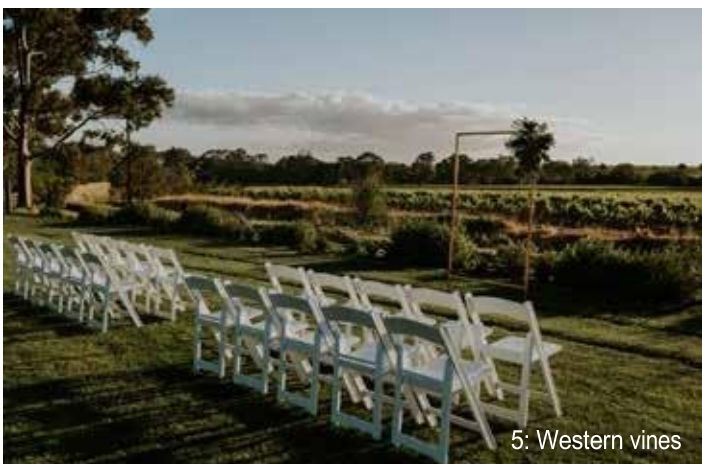
5: Western vines

We are happy to assist, support and discuss with you all of your plans, putting many years of local knowledge and experience to good use.