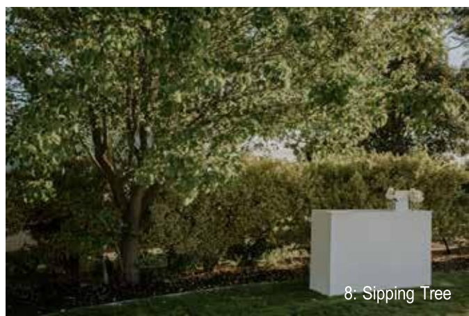
8: Sipping Tree