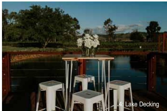
4: Lake Decking