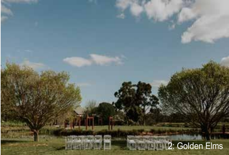
2: Golden Elms

The truly unique beauty of Lanzerac Country Estate is that we don't have in-house caterers, drinks packages or menus. You can let your creativity shine and bring in all your favourite food and beverage choices.