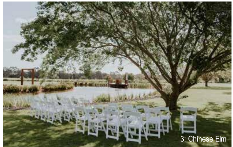
3: Chinese Elm

You can choose from multiple ceremony, reception or pre/post event locations across the estate to give each aspect you create a unique setting.