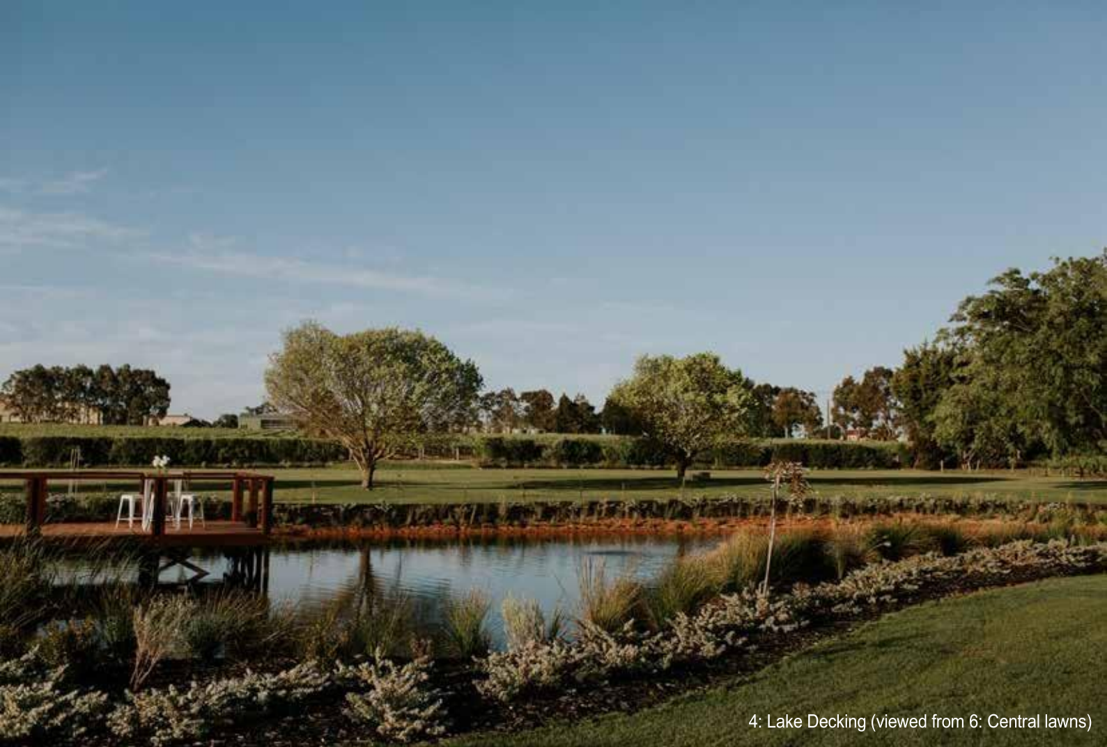
4: Lake Decking (viewed from 6: Central lawns)