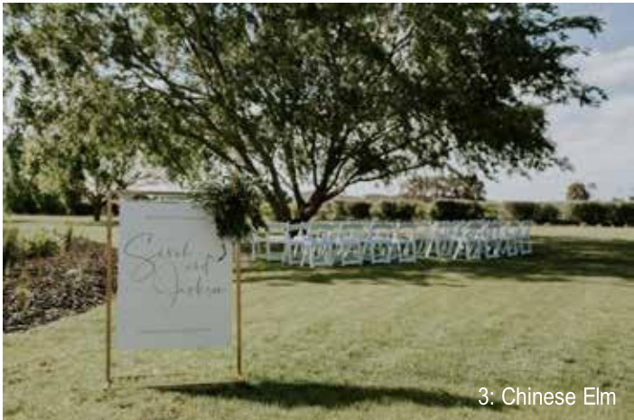
3: Chinese Elm