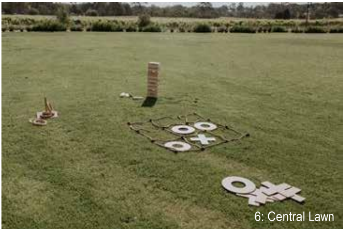
6: Central Lawn